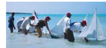
[ Pictured at top of next column. ]